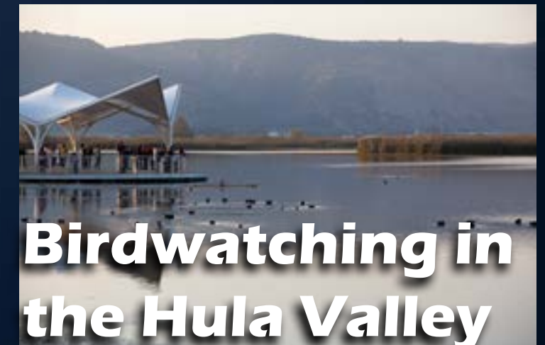
Birdwatching in the Hula Valley