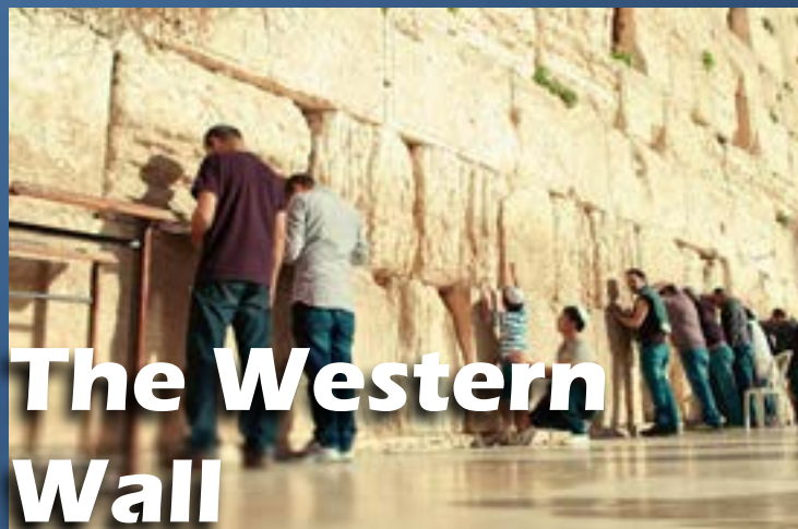
The Western Wall