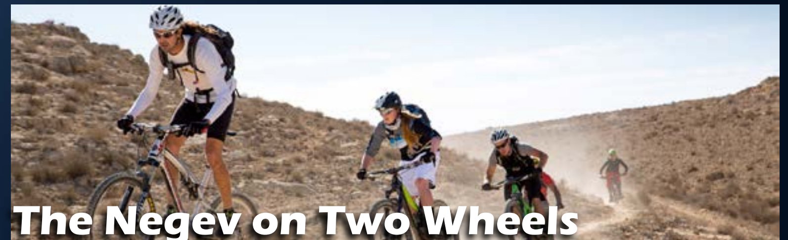
The Negev on Two Wheels