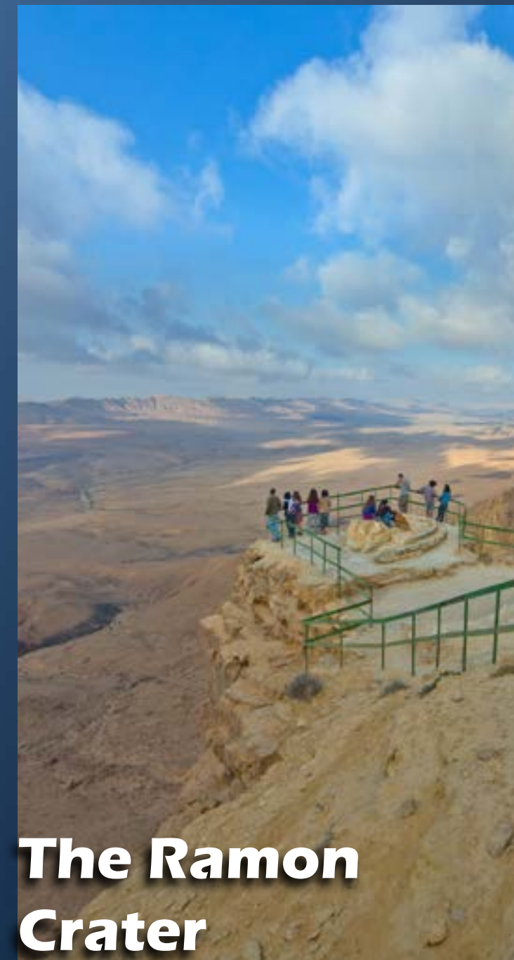
The Ramon Crater

Bursting with life, the Negev Desert can be explored by bike or car, jeep or camel. Visitors can experience the awe of historic ruins, visit authentic nomadic tribes, enjoy breath-taking scenery and stunning geological wonders.