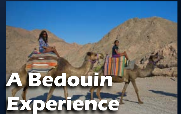
A Bedouin Experience