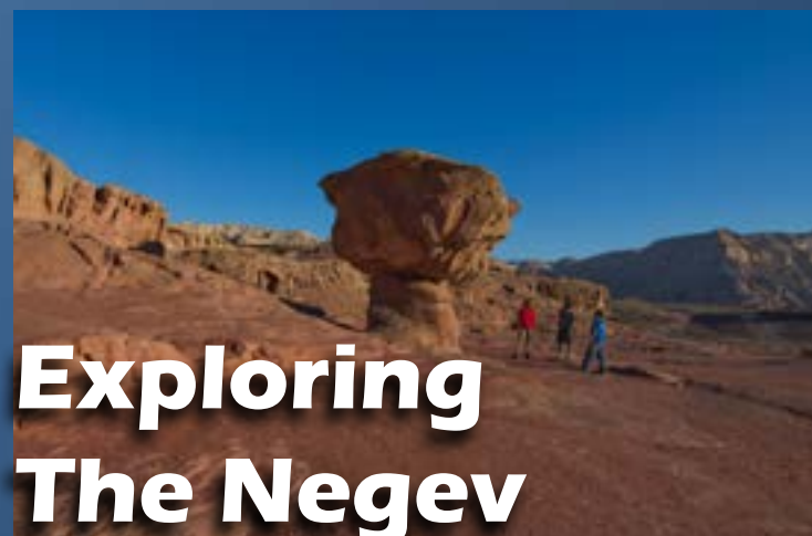
Exploring The Negev