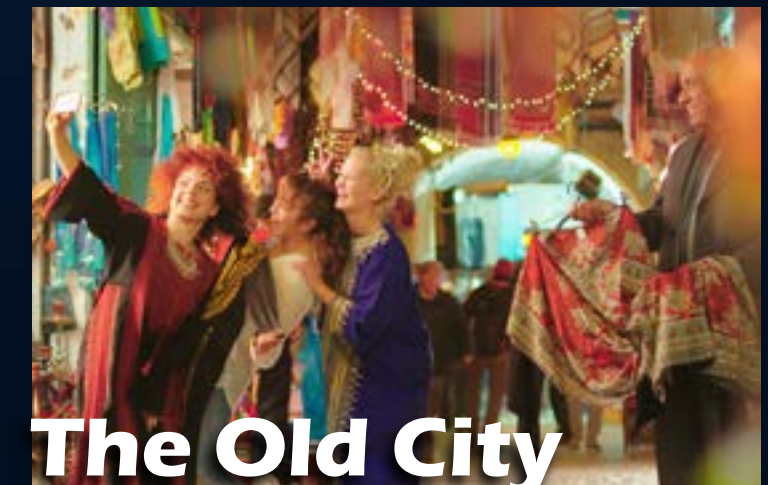
The Old City