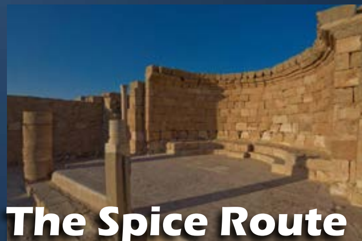
The Spice Route