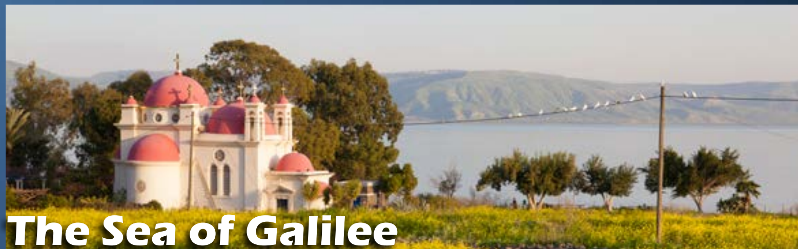
The Sea of Galilee