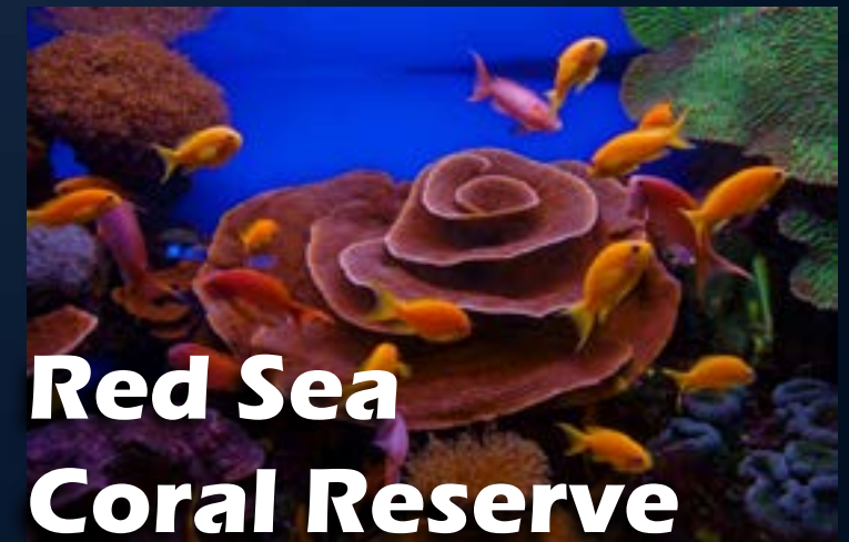
Red Sea Coral Reserve