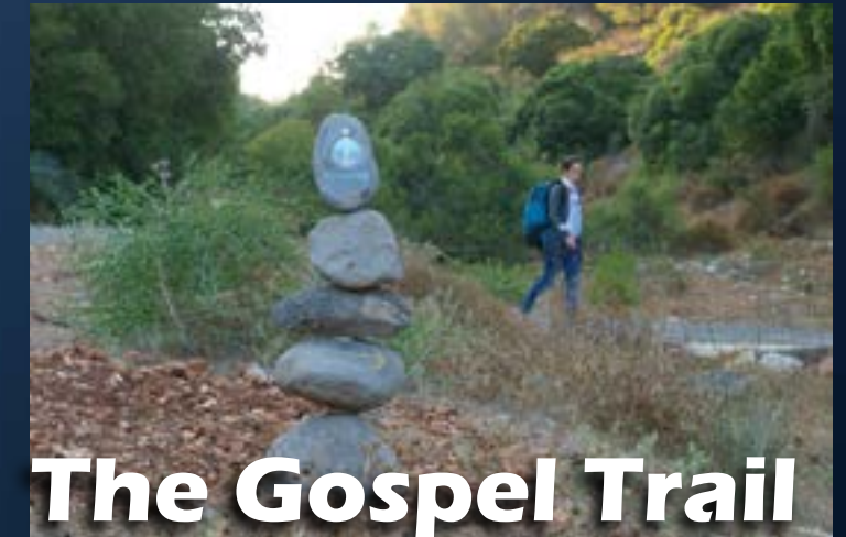
The Gospel Trail