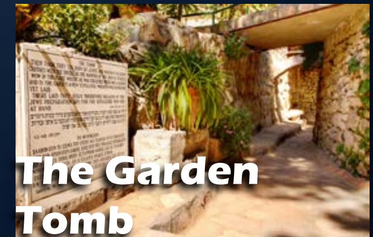
The Garden Tomb