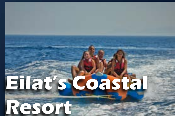
Eilat's Coastal Resort