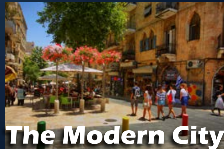
The Modern City