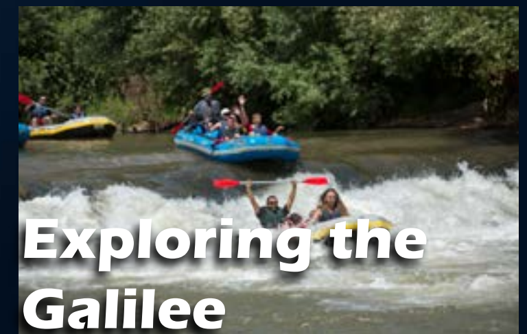
Exploring the Galilee